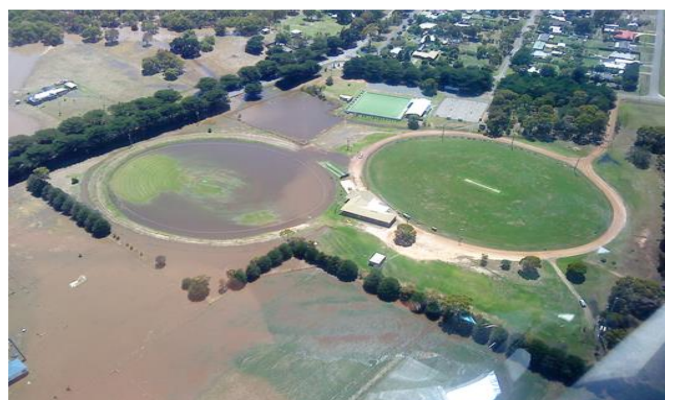
Inverleigh, January 2011

Flood information for the Leigh River at Inverleigh