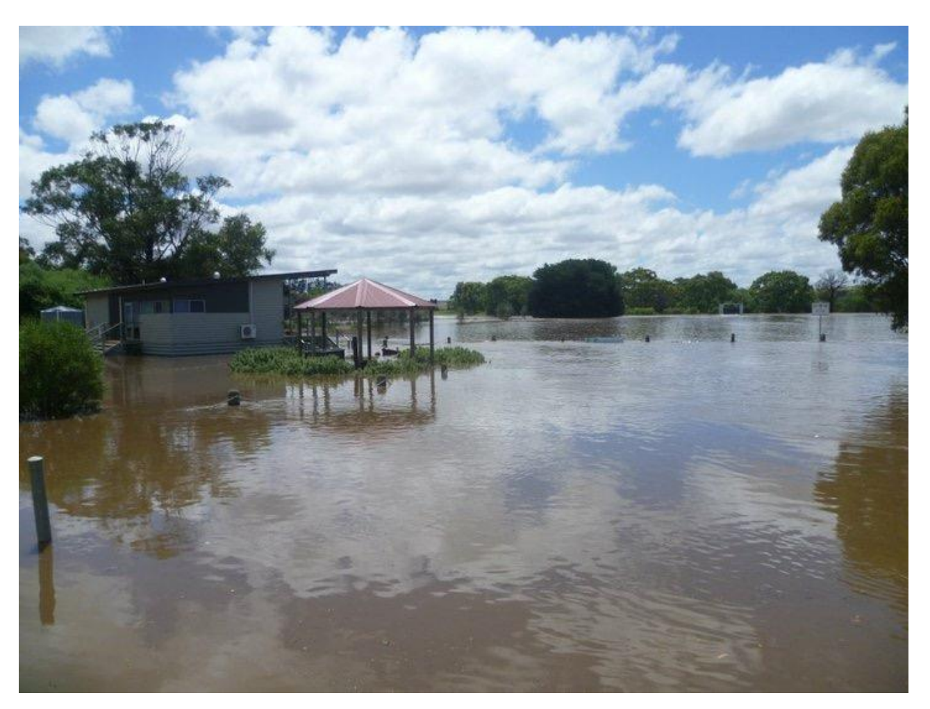
January 2011, Shelford Recreation Reserve