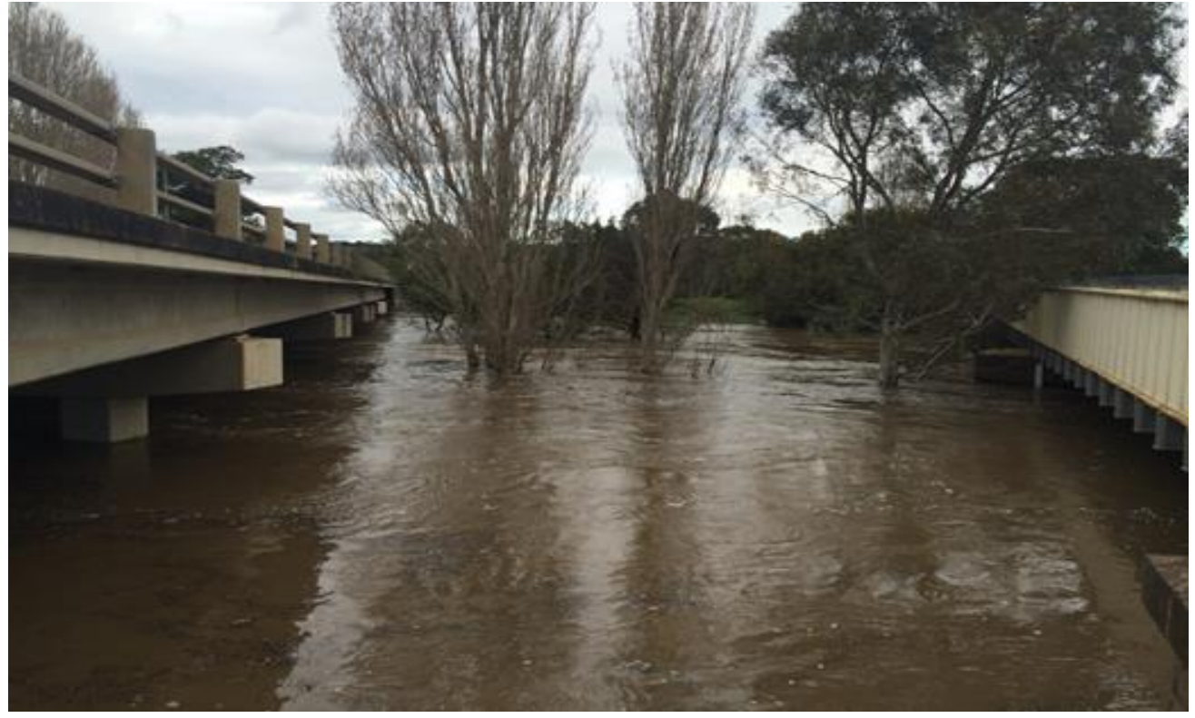
Shelford, 2016

Flood information for the Leigh River at Inverleigh