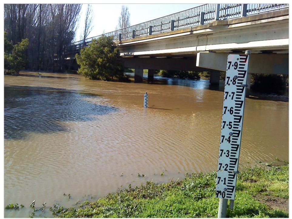
January 2011, Shelford