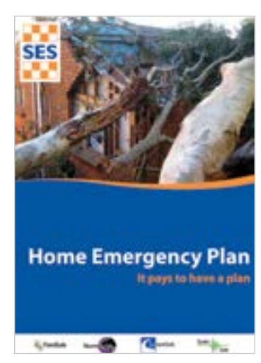
Visit ses.vic.gov.au to obtain a copy of your Home Emergency Plan workbook