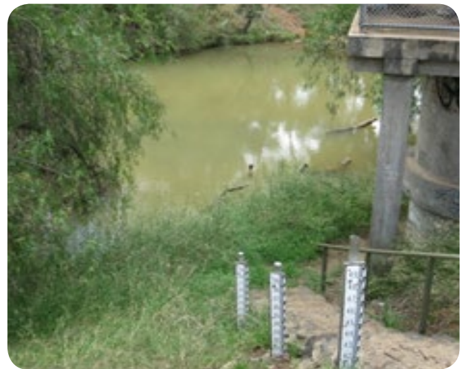
Werribee River gauge at Peppertree Park

If you live in a low-lying area or close to a creek or river you may be at risk of flooding. Even if you are not directly affected, you may still need to detour around flooded areas, and power and sewage may be affected.