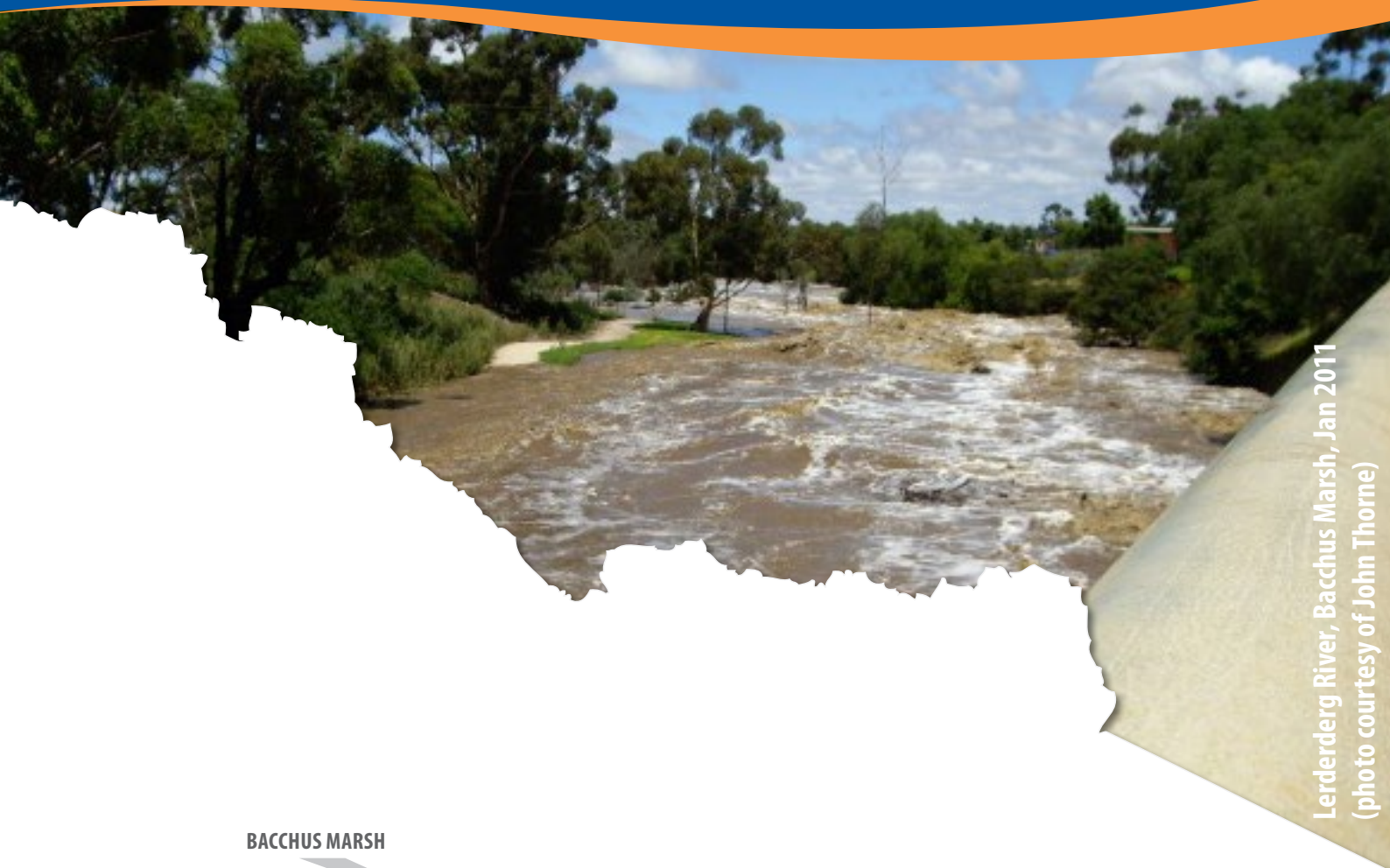
Lerderderg River, Bacchus Marsh, Jan 2011

Flood information for the Werribee and Lerderderg Rivers at Bacchus Marsh