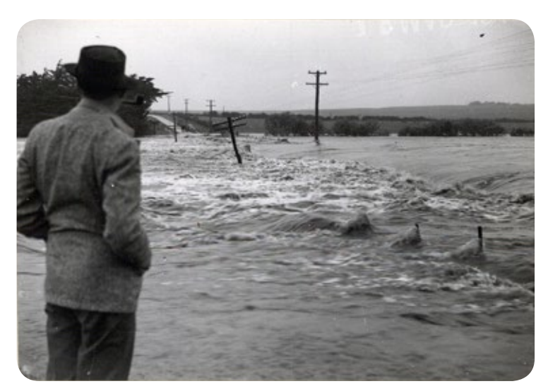
1946 Warrnambool flood