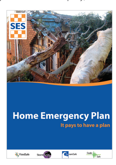
Visit ses.vic.gov.au to obtain a copy of your Home Emergency Plan workbook